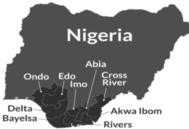
Figure 1: Constituent administrative states of the Niger Delta, Nigeria